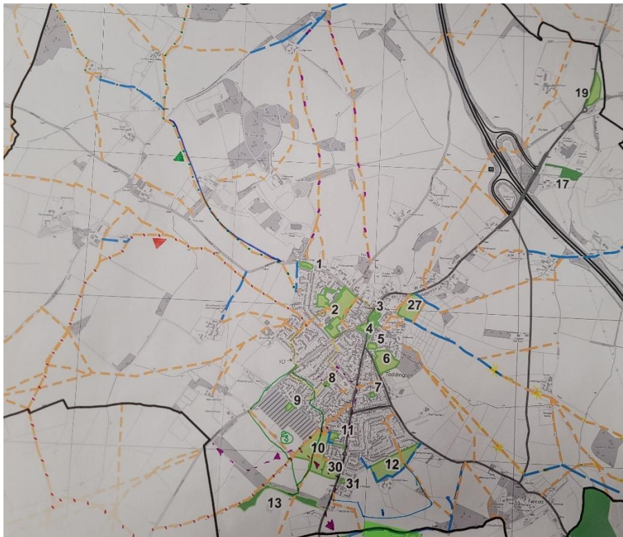
Favourite Walks/Rides Map